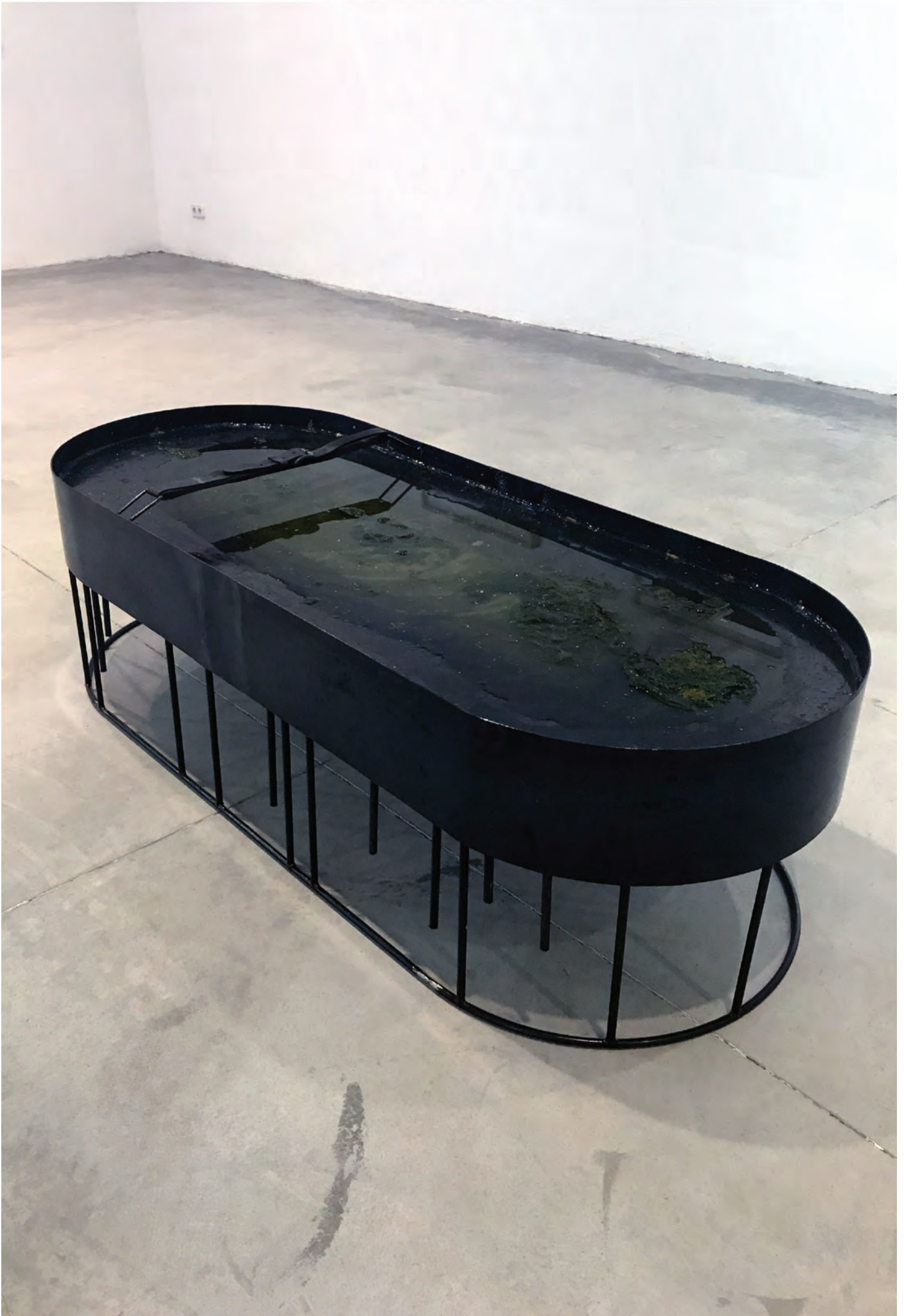
"Re-sounding Organ" - Steel, speaker, audio - 173 x 68 x 50 cm