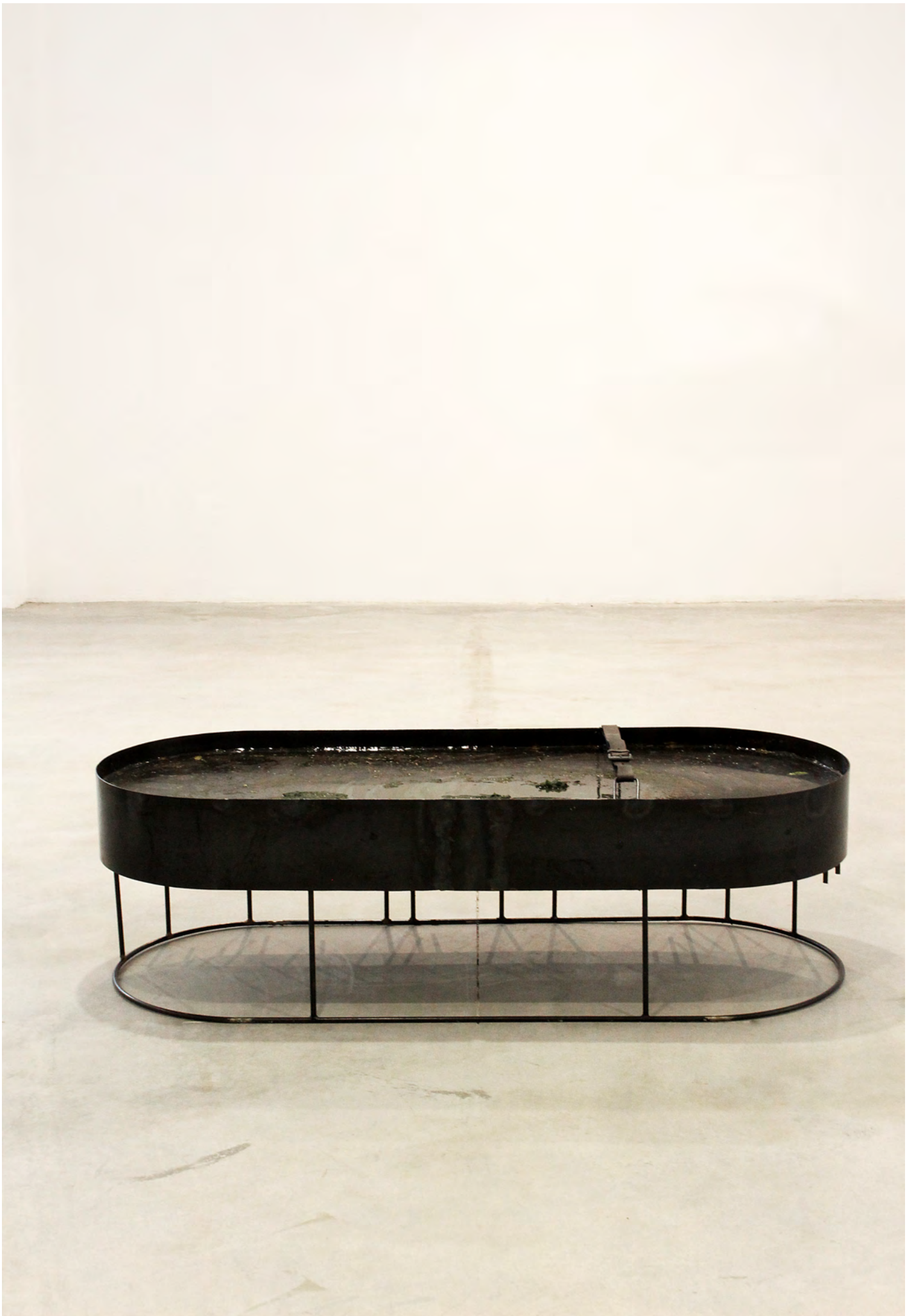
"Re-sounding Organ" - Steel, speaker, audio - 173 x 68 x 50 cm